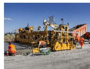
Pavement Quality Concrete