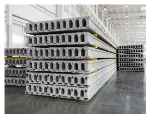
Hollow Core Slab