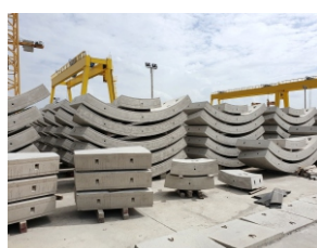
Mould Release Agent