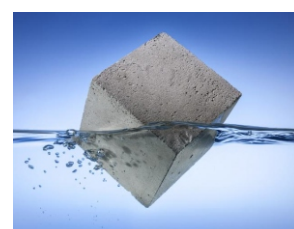
Light Weight Concrete